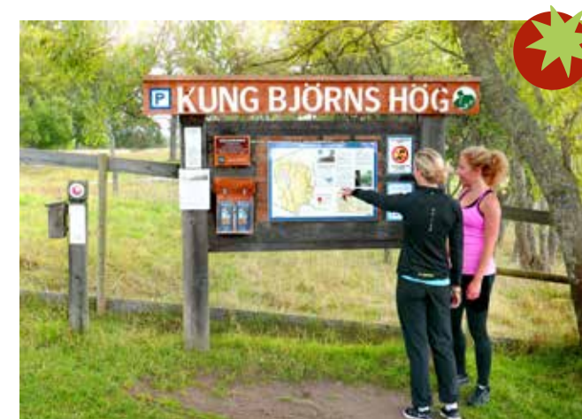
Kung Björns hög.